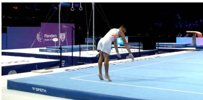
FX - Move camera and zoom