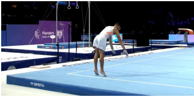
FX - Move camera and zoom