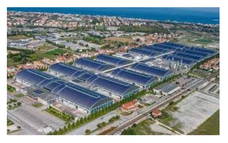
\label{lem:competition Hall-Warm Up and Training Hall} \textbf{Competition Hall-Warm Up and Training Hall}