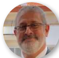
Workshops Domingos Fradinho