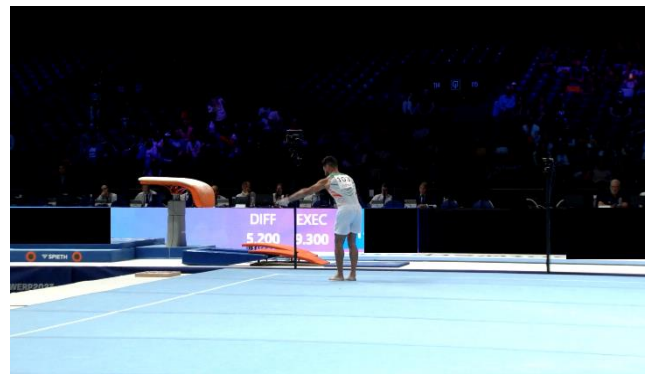
FX - Move camera and zoom