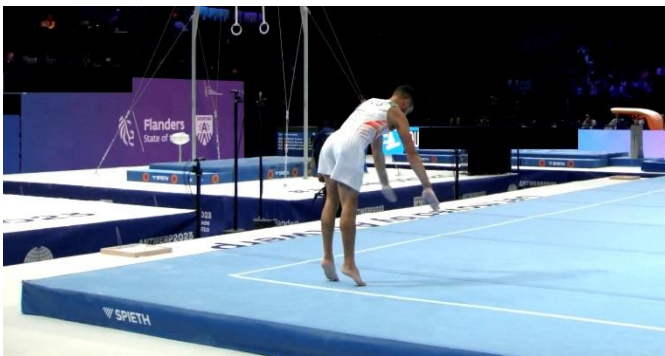
FX - Move camera and zoom