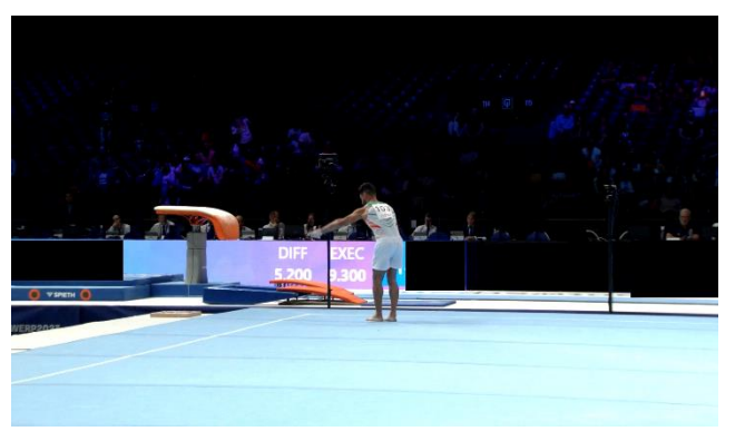
FX - Move camera and zoom