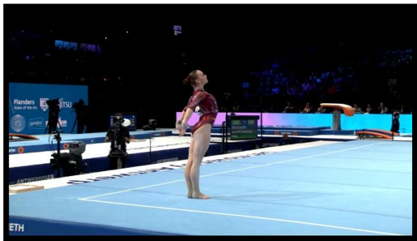
FX - Move camera and zoom