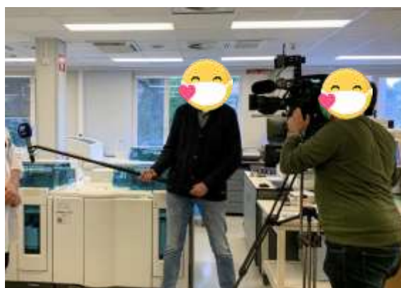
Example long microphone